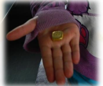
One tonne of rock mined to produce this much gold.